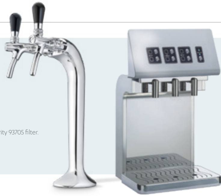
Bridge, button control

30 – 80 litre models come with a HCF3 Filtration kit including Zip MicroPurity 93705 filter. All push-button dispense models feature portion control.