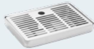
Drip Tray 94773